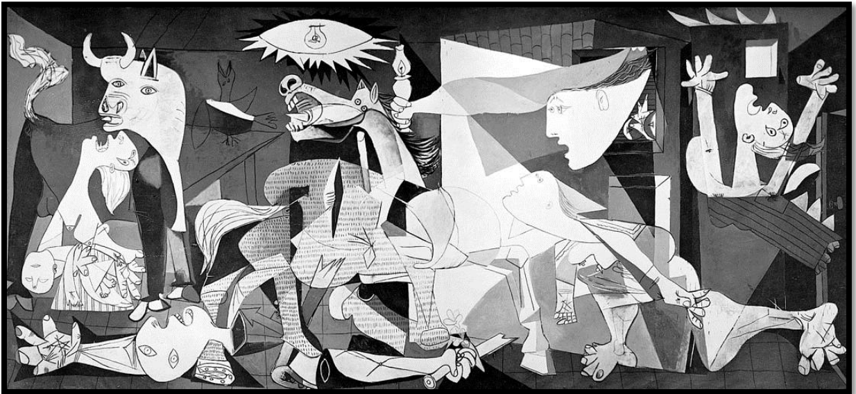
This is a mural-sized oil on canvas by the Spanish artist Pablo Picasso completed in June 1937. Picasso represents the sufferings of people and animals in the aftermaths of the bombing of Guernica, a village in northern Spain, by German and Italian warplanes, which were supporting Spanish nationalist forces during the Spanish Civil War (1936-1939). Reina Sofia Museum, Madrid.